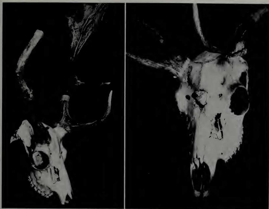
Fig. 14 (left). Skull of fallow deer buck „Ł-1“ — Fig. 15 (right). Skull of fallow deer buck „Ł-3“

brow tine 10.5 cm long. The left, normal antler has a beam 24 cm and a brow tine 12 cm in length. The antler grafted on the frontal bones is 3 cm long.